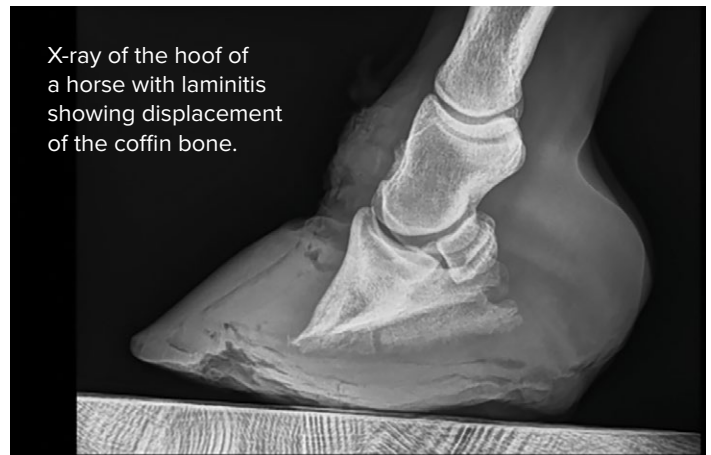
X-ray of the hoof of a horse with laminitis showing displacement of the coffin bone.