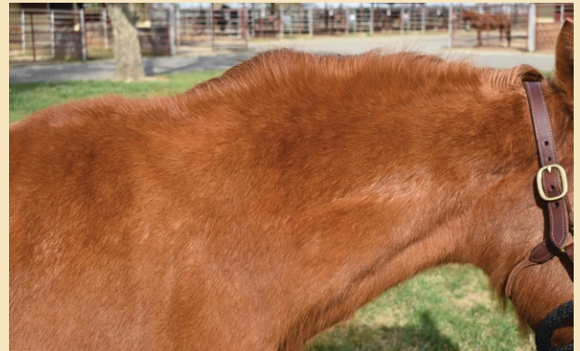
Increased fat deposition on the neck of a horse with EMS.

Pituitary pars intermedia dysfunction, also known as Cushing’s Disease, causes progressive degeneration of neurons in the brain as horses age, resulting in production of high levels of hormones such as adrenocorticotropic hormone (ACTH) and cortisol. Clinical signs include a long, curly hair