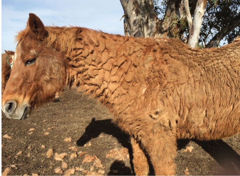
Long, curly hair coat characteristic of PPID.

Laminitis is damage and inflammation of the tissue between the hoof and the underlying coffin bone (distal phalanx, P3). This tissue, the laminae (also called lamellae), is actually folded layers of tissue, contacting the surface of the bone on one side and the inside of the hoof wall on the other, connecting the two. Depending on how severely these attachments are weakened, the outcome can range from mild foot soreness to separation of the coffin bone and hoof (founder). The front hooves, which bear the majority of the horse's weight, are most commonly affected, but it can also occur in the hind hooves.